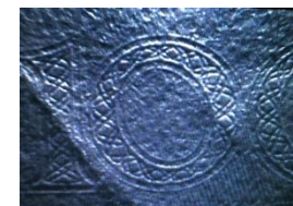
Side IR light